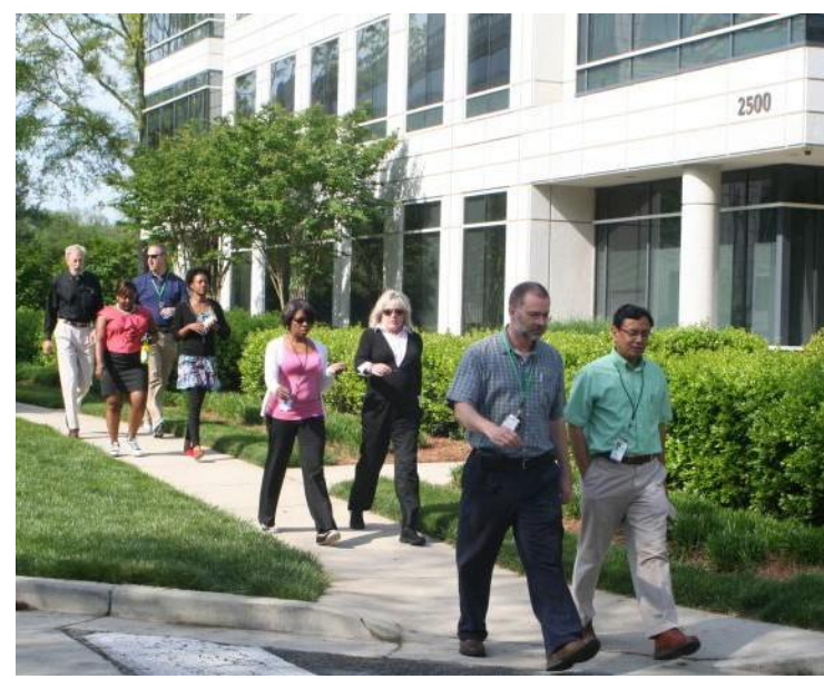
A Consensus Response to EEOC Proposed ADA and GINA Regulations on Employer-Sponsored Wellness Programs